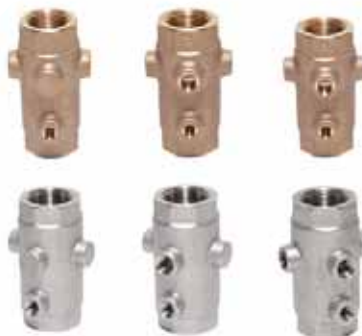
VFD Tapped Valves

Patented submersible pump check valve for use on variable flow demand (VFD) systems and applications. Standard check valves will "chatter" and be noisy when the system goes to low flow, eventually causing failure. These unique valves are designed to minimize flow losses