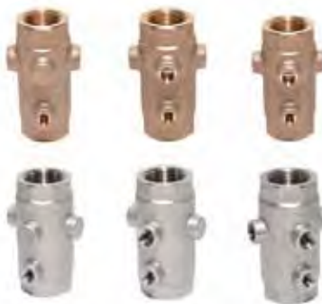
VFD Tapped Valves

Patented submersible pump check valve for use on variable flow demand (VFD) systems and applications. Standard check valves will "chatter" and be noisy when the system goes to low flow, eventually causing failure. These unique valves are designed to minimize flow losses